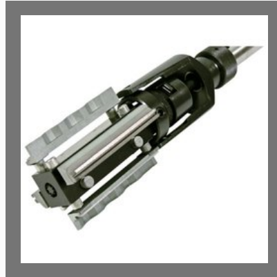
Vertical Honing Holders