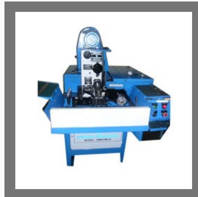
Automatic Horizontal Honing Machine