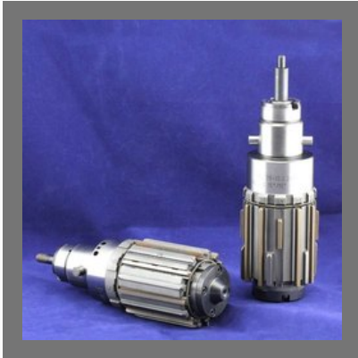
Hydraulic Honing Holder