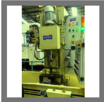
Vertical CNC Honing Machine