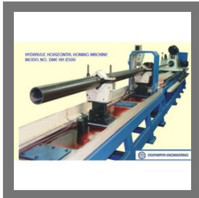
Hydraulic Horizontal Honing Machine