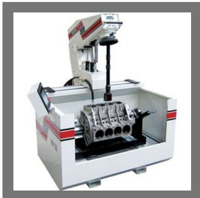
Cylinder Block Vertical Honing Machine