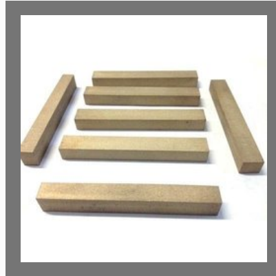
Silicon Carbide Honing Stones