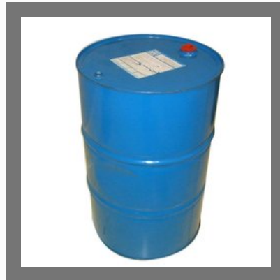
Industrial Honing Oil