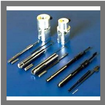
Honing Mandrils Tools