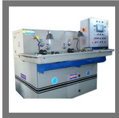
Dual Spindle Automatic Horizontal Hydraulic PLC Honing Machine