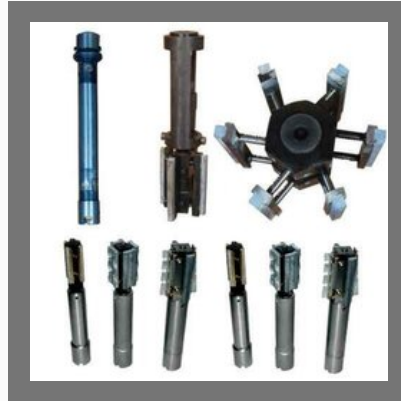
Mechanical Honing Head Holder