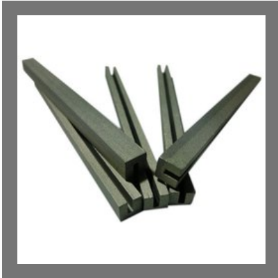
Diamond Honing Stones