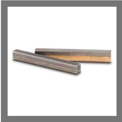
CBN Honing Stones