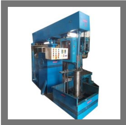
Semi Automatic Vertical Honing Machines