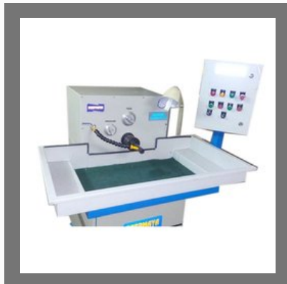
Single Spindle Manual Horizontal Honing Machine