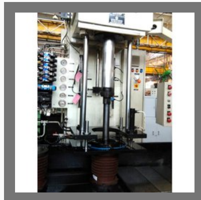
Vertical Hydraulic Honing Machine