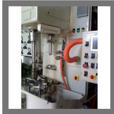
Vertical Plateau Honing Machines